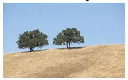
Near our home we have beautiful oak trees. It is hard to do them justice because the skies are most of the time just plain boring.