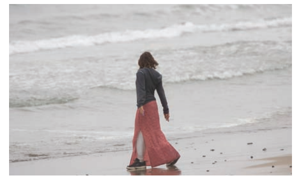
When we captured this girl at the beach, we liked the posture and the hippie-like skirt. But we were not too keen about the shoes and the boring ocean surf.