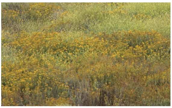
These wildflowers shot at Big Sur using a long focal length were not intentionally photographed to be a texture.