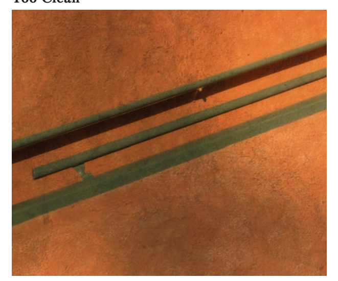
These are the handrails of some stairs in Monterey, CA. We found the original photo "too clean." In contrast, the blended photo invokes a more interesting "mood." We used a photo of a dirty wall for the texture.