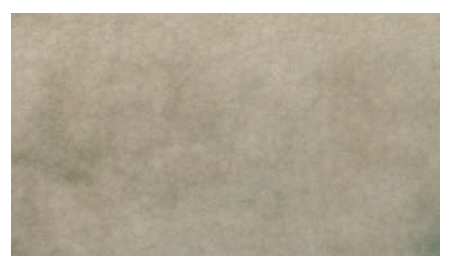
When the image is blended, the trees can show why they are special.