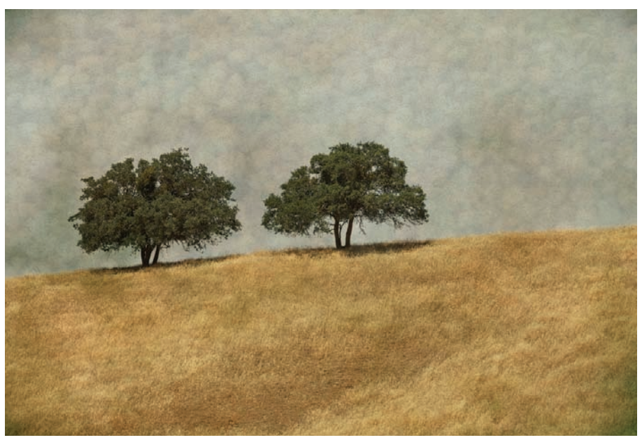
On one hand, you have to photograph these trees against the sky to show their beautiful shape and on the other hand, it is hard even to imagine the ideal sky.