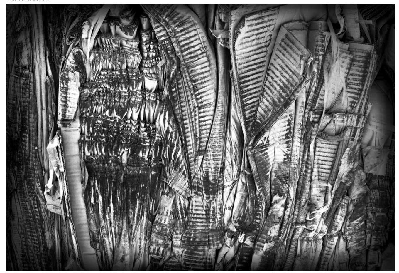
We like the image because it is quite abstract. What we see is actually compressed cardboard at a local recycling yard. In this case, the B&W conversion was created using our special B&W texture with frame. Both the main image and the texture image were taken with an iPhone.