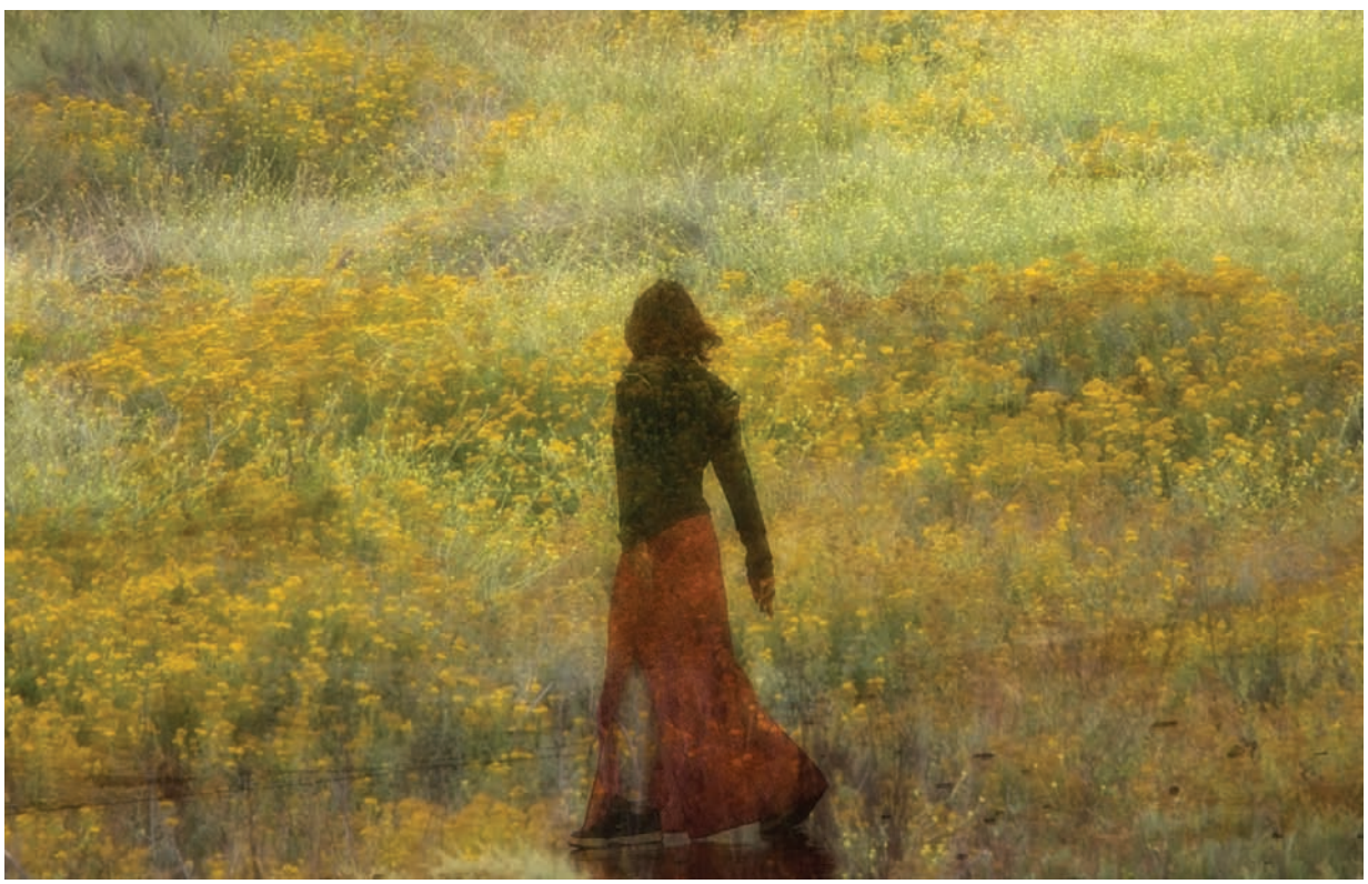
Now the photo looks more like how we felt while capturing the scene. The posture is the key element, the boring background gone and the shoes well-hidden.