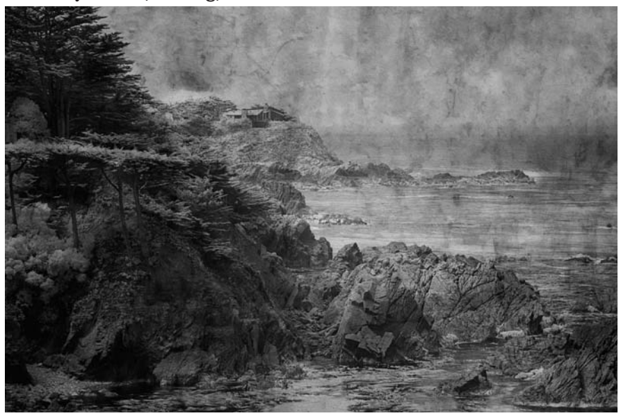
This photo looks like an old etching. We had no intention of simulating an etching look, but this was the result of our exploration process. The original photo was a digital infrared photo taken with an IR modified camera. The texture used is a photograph of the metal fish container surface in Monterey.

References Digital Outback Photo www.outbackphoto.com